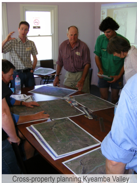
Cross-property planning Kyeamba Valley

Working together, neighbours identify key areas of native habitat and cross-property connectivity opportunities.