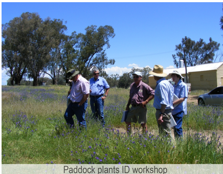
Paddock plants ID workshop

Responding to the production essentials and knowledge needs in each area, a series of workshops are on offer drawing on expertise from a range of partners including NSW DPI and the Conservation Management Network. These can include paddock plants ID, flora & fauna audits, rotational grazing, connectivity, farm dam management, native grasses.