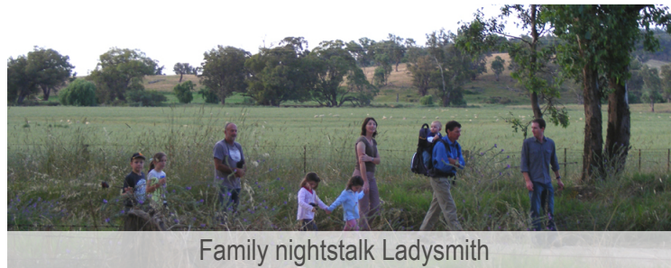
Family nightstalk Ladysmith

Contact Murrumbidgee Landcare Inc Room 6, E Block, Wagga Agricultural Institute, Pine Gully Road, Wagga Wagga P.O.Box 710, Wagga Wagga Email: office@murrumbidgeelandcare.asn.au Phone. 02 6933 1443 mob. 0431 953 778