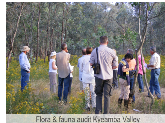
Flora & fauna audit Kyeamba Valley

Linking people, communities and native habitat in the mid Murrumbidgee catchment