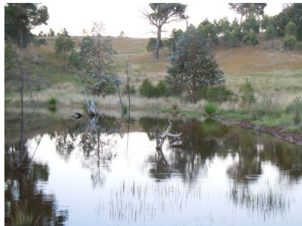
A biodiverse farm dam