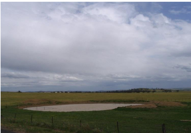
A typical farm dam, with little biodiverse vegetation surrounding it

While the water keeps stock alive, it has been estimated that the live weight of stock reduces by as much as 20% when they drink poor quality water, and their overall health similarly deteriorates. Improving the health of your dam will boost your farm business and local biodiversity.