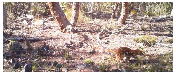
Spotted Quoll caught on one of our infrared cameras

We are looking for landholders in the Eastern Riverina to participate in a citizen science survey of the wildlife on their property. We will teach you how to set up a camera trap and then lend you a camera for two weeks so you can find out what animal species are on your land.