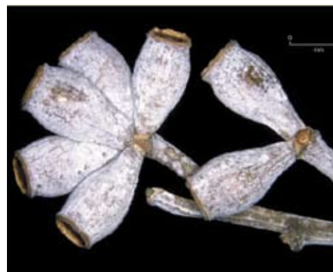
▲ White Box identifying characteristics: Fruit