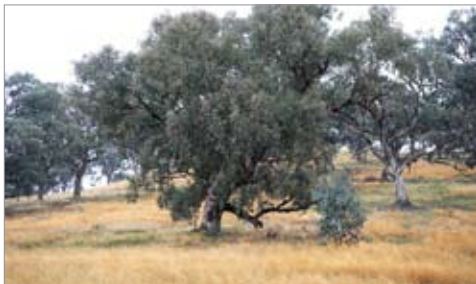
▲ White Box form