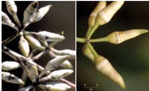
▲ Blakely's Red Gum identifying characteristics: Bud