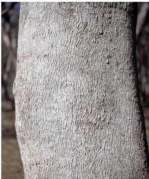
▲ White Box identifying characteristics: Bark