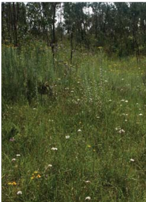
▲ Wildflowers in Spring