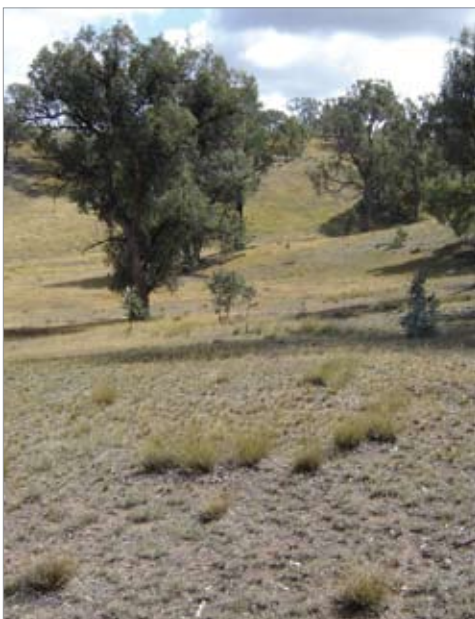
▲ Lightly grazed paddocks and woodlots: