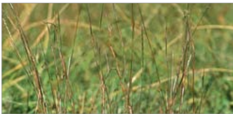
▲ Red Grass