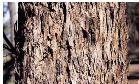
▲ Yellow Box identifying characteristics: Bark