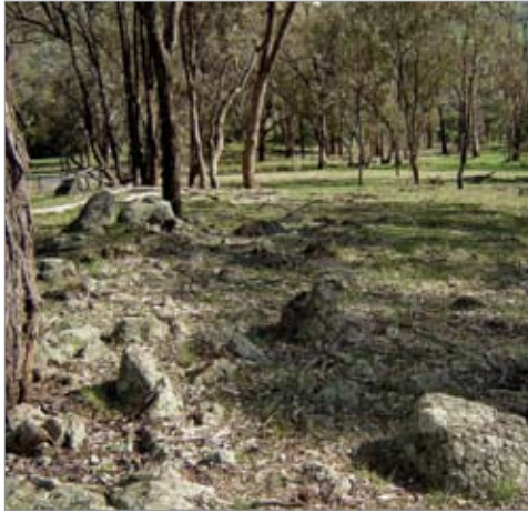
▲ Rocky parts: (Photo courtesy: Ian Davidson)