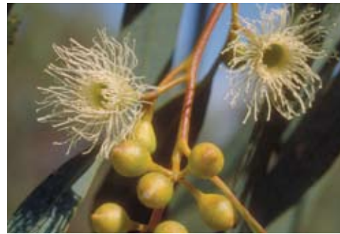
▲ Yellow Box identifying characteristics: Bud