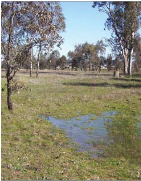
▲ Seasonally wet pothole country: (Photo courtesy: Ian Davidson)

Box Gum Grassy Woodlands are now most often found in the “rough” or “unimproved” parts of properties and may include: