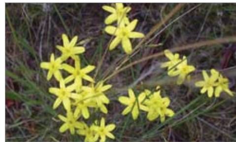
▲ Yellow Rush Lily