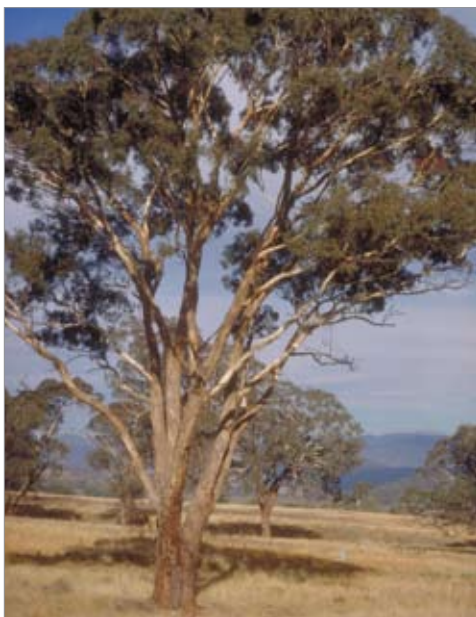
▲ Yellow Box form