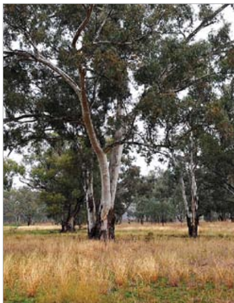
▲ Blakely's Red Gum form