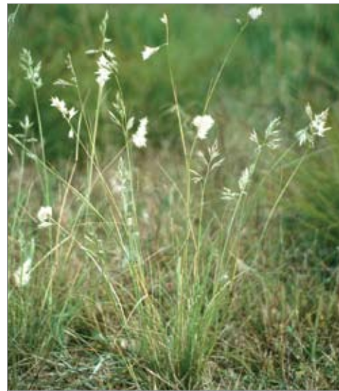
▲ Wallaby Grass