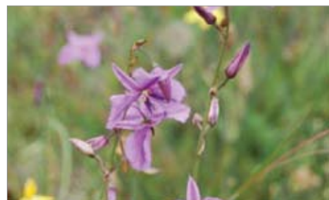
▲ Chocolate Lily