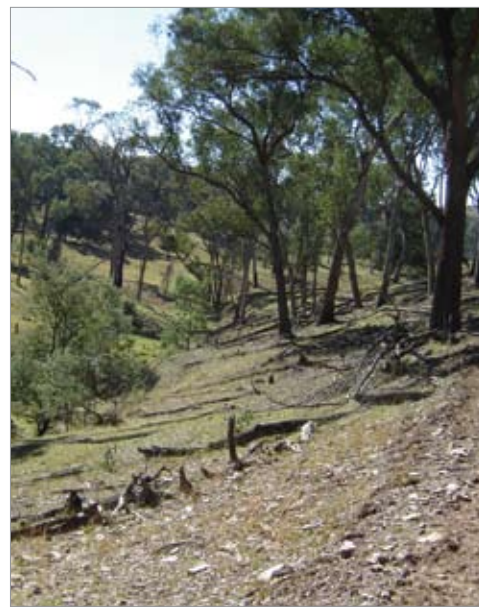
▲ Timbered creeklines and laneways: (Photo courtesy: Ian Davidson)