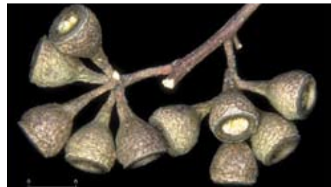
▲ Yellow Box identifying characteristics: Fruit