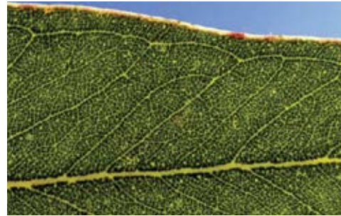
▲ White Box identifying characteristics: Leaf