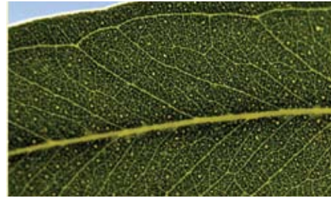
▲ Yellow Box identifying characteristics: Leaf