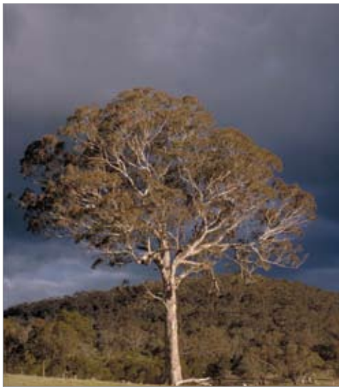
▲ Yellow Box form

These trees have a spreading dense crown of fine grey-green foliage with fibrous-flaky dark brown “box” bark, often shedding in short ribbons from above.