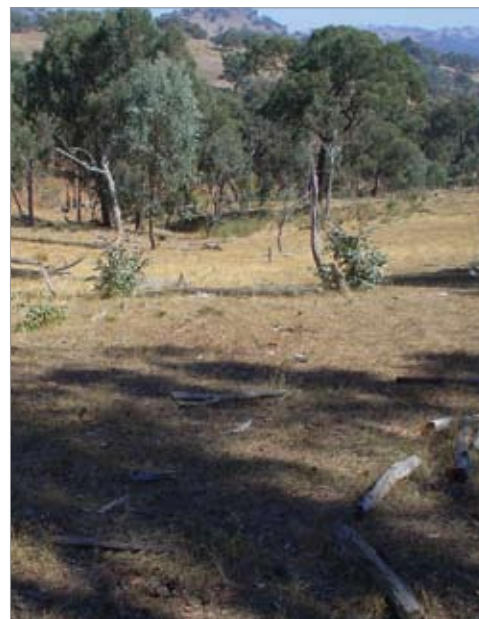
▲ Unimproved hill slopes: