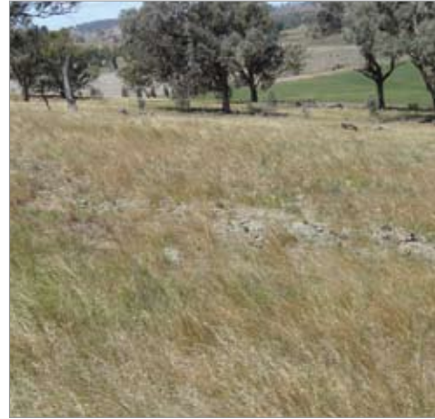
▲ Native Pastures: