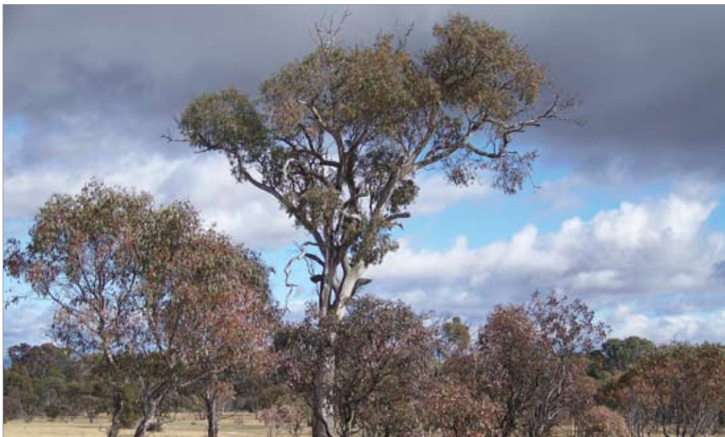
▲ Blakely's Red Gum

Box Gum Grassy Woodland has White Box, Yellow Box or Blakely's Red Gum (Hill Gum) as the dominant eucalypt species (in the Nandewar region, Inland Grey Box or Coastal Grey Box are the dominant species). Other species of native trees may be found within this ecological community including Red Box, Apple Box, Inland Grey Box (South of the Nandewar region), Poplar Box, Fuzzy Box, White Cypress Pine and Kurrajong.