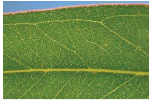
▲ Blakely's Red Gum identifying characteristics: Leaf

Notice from the previous pictures of these woodlands that the tree cover generally has a "park like" appearance with the canopies seldom touching. This is typical of Box Gum Grassy Woodlands.