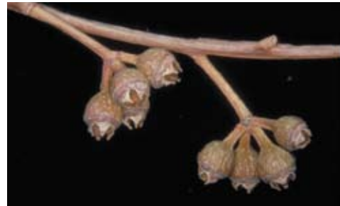
▲ Blakely's Red Gum identifying characteristics: Fruit