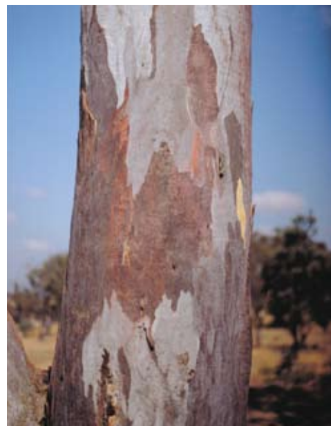
▲ Blakely's Red Gum identifying characteristics: Bark