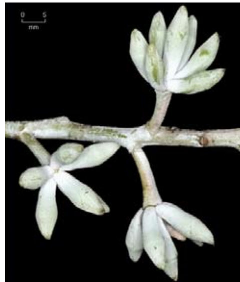
▲ White Box identifying characteristics: Bud