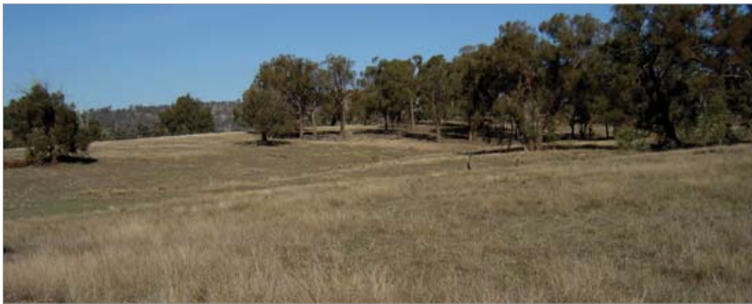
▲ Derived Grassland

Amongst the grass tussocks many wildflowers may be found providing a very colourful display in spring. Some of the more common wildflowers include lilies, orchids, daisies, native peas etc.