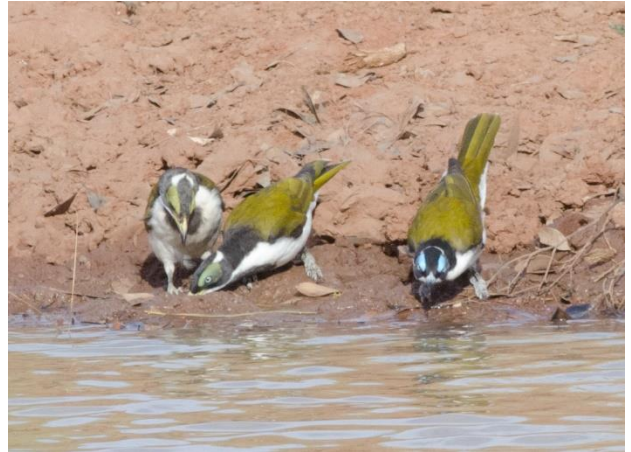
Blue-faced Honeyeater at a dam (above) Mulga Parrot (below) Kangaroos came in to drink (bottom) Black Honeyeater (left)