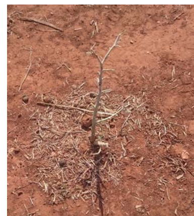
SLN stems after grazing