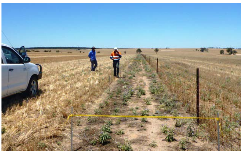
SLN fenceline trial in North Kukerin, WA