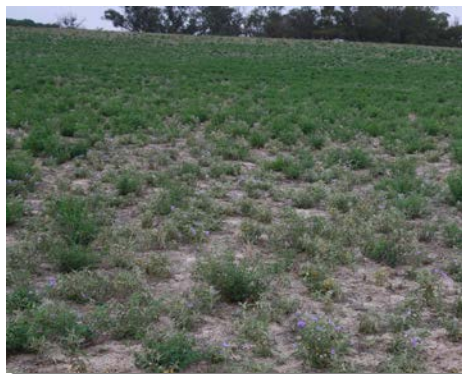
SLN in degraded lucerne pastures