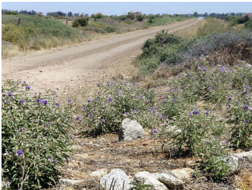
SLN along a roadside in Central Victoria

SLN that has spread to inaccessible areas in rocky hilltops or along creeks, can become nursery areas, producing seed that can re-infest roadsides and clean paddocks. In inaccessible hilly areas consider planting eucalypt species that are known to have allelopathic capacities against SLN.